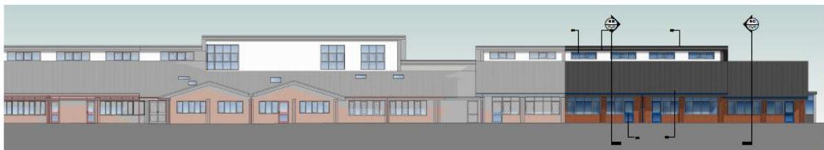
Phase 2 East Elevation