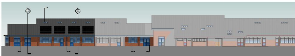
Phase 2 West Elevation